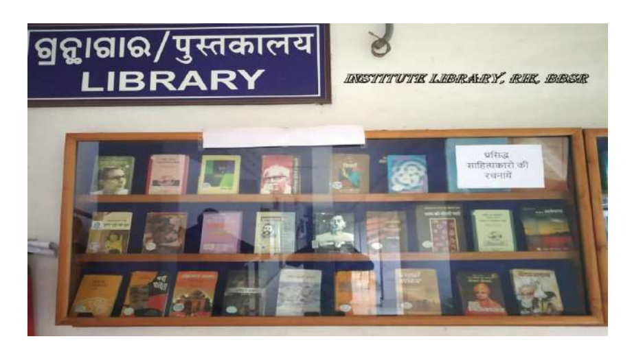
New Arrivals Book Display