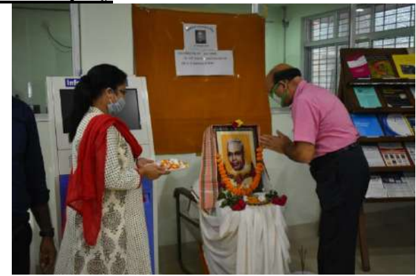
National Librarians Day Celebration